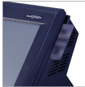
1, 2 & 3 Track MSR reader