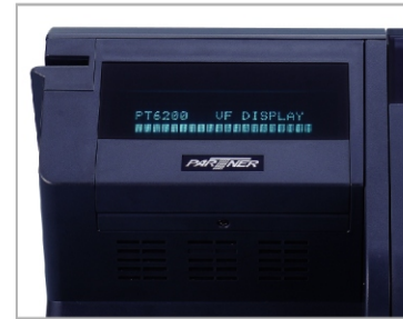
Integrated customer display